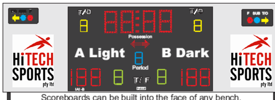
Scoreboards can be built into the face of any bench.

Benches are usually manufactured in "Light Gray" unless a colour is specified.