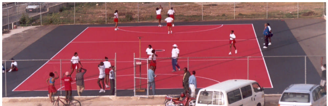
The Jamaican National Team practice on PowerGame™

PowerGame™ offers an alternative, combining timber floor performance with the latest technology to create a cutting edge outdoor surface.